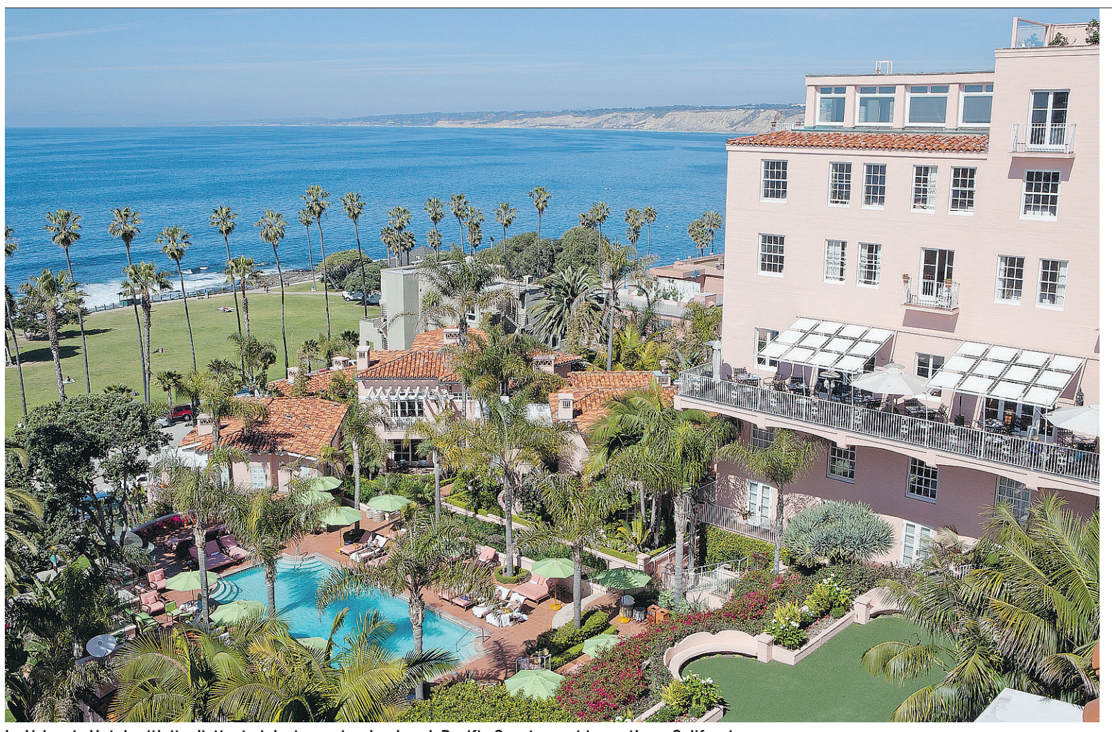
La Valencia Hotel, with its distinct pink stucco, is a landmark Pacific Coast resort in southern California. LA VALENCIA